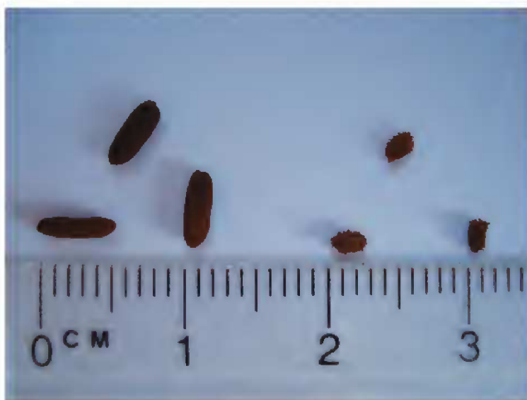
Figure 4: Seed comparison: Roridula dentata (left) and R. gorgonias (right).

Once treated keep the seeds in a sunny position, ideally in a greenhouse and keep wet. Germination can take several weeks, and eventually the testa will split and a root will emerge. The seedling will grow and shed the testa allowing the leaves to develop. R. dentata often takes a further few weeks to shed its' seed coat and it can appear to be struggling to dispose of it. Don't be tempted to remove it as you are likely to snap the developing shoot inside and kill the plant. In August 2007, I